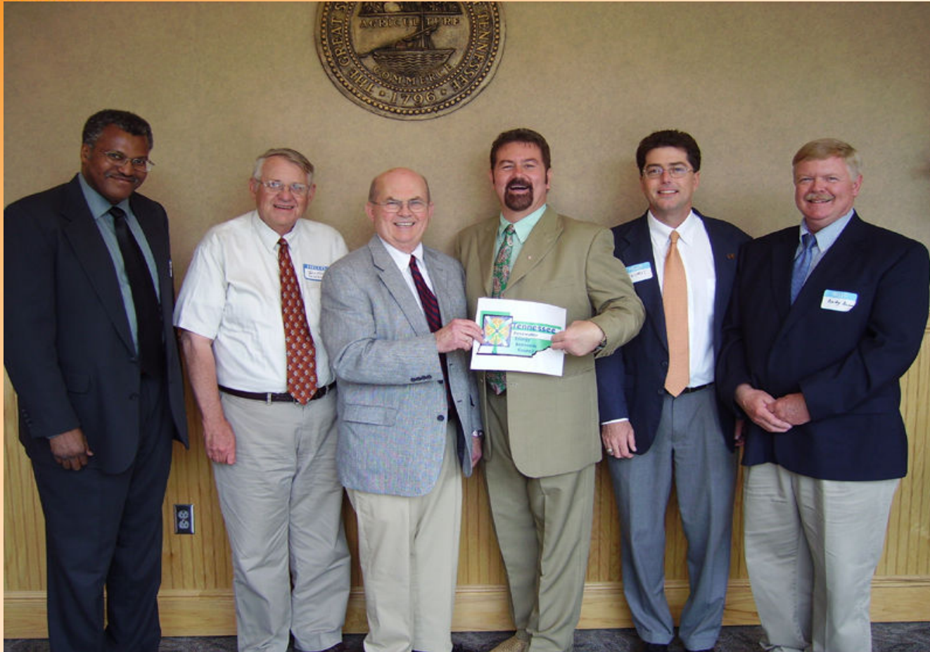
Founding Executive Committee Fall Creek Falls