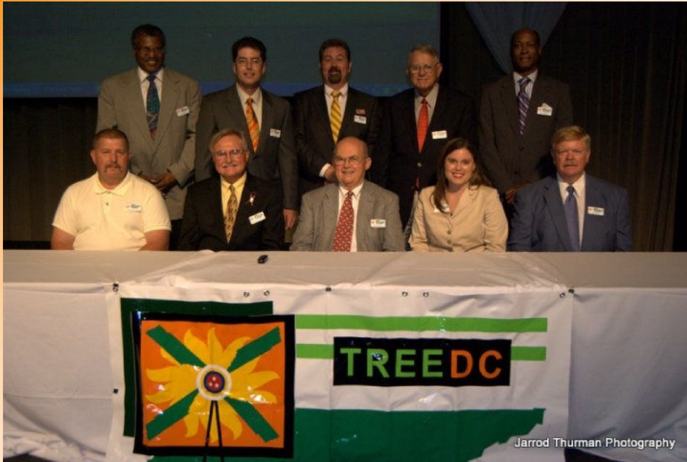
TREEDC - Franklin